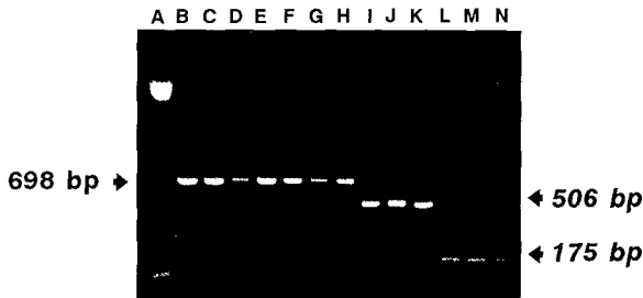
FIGURE 2. Fragments amplified from extracted genomic DNA using the four-primer species identification assay. Lane A, 123-basepair (bp) ladder size marker; lanes B–D, Culex p. pipiens individuals from Colorado, Virginia, and Illinois populations; lanes E–H, Cx. p. quinquefasciatus individuals from Texas, Florida, Louisiana, and Arkansas populations; lanes I–K, Cx. restuans individuals from Illinois, Maryland, and Louisiana populations; lanes L–N, Cx. salinarius individuals from Arkansas, Louisiana, and Ohio populations. Arrows indicate the 698-bp Cx. pipiens complex fragment, the 506-bp Cx. restuans fragment, and the 175-bp Cx. salinarius fragment.

cle of SLE virus, species identification of specimens is critical to an evaluation of surveillance data.